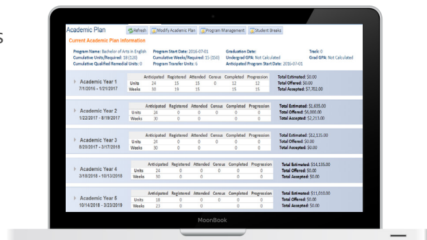
Student Academic Plan for the Life of the Program