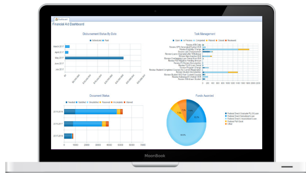
Financial Aid Administrator Dashboard

Regent 8 offers an exception-based process to replace the traditional, report-driven manual review required to ensure compliance. The solution automatically assigns tasks prompting administrators to focus on the most important exceptions. In cases where manual intervention is appropriate, Regent 8 provides those tools too. Thus, you have the best of both worlds: highly automated processing with opportunities for manual intervention as needed.